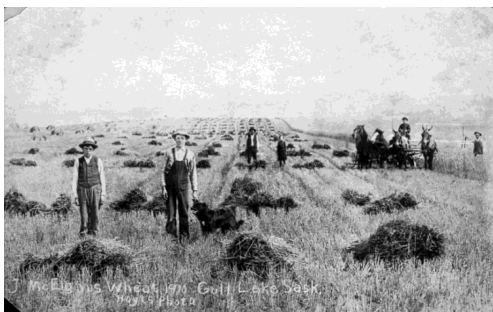
J. McElguun’s Wheat Farm, 1910 Gull Lake Saskatchewan

My three older siblings and I were born in Gull