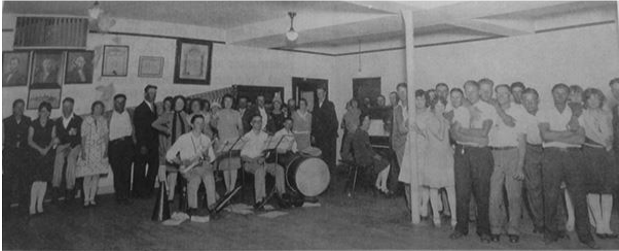
Basement, Memorial Legion Hall, Minnewaukan North Dakota. Benson County Farmer's Union , week of June 23, 1930, page 8

“He’s already left mother. He said that they’d have to throw the food away if he didn’t deliver it to somebody and that they won’t charge the Steins. Maybe you can do Mrs. Steins’ hair for free next time she comes over. But we’ll remind Noel when we see him again too. You’ll remind him, won’t you Veronica?”